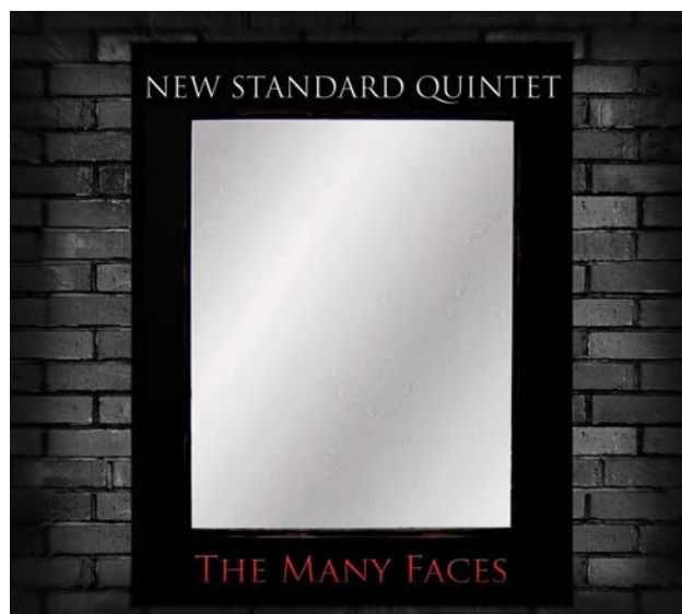
The Many Faces CD (2011)